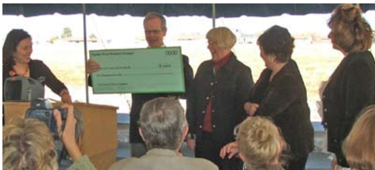
The Pueblo West Women's League presents the library with a $5,000 check.