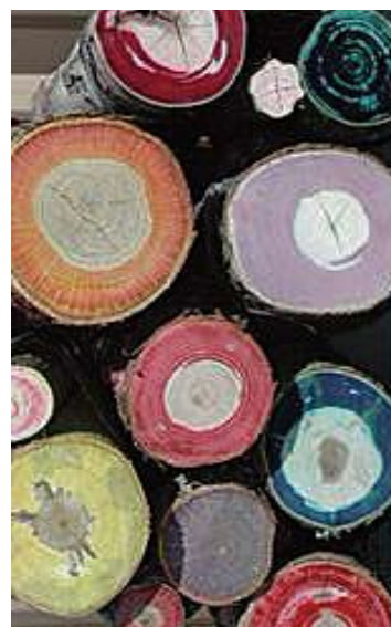
The colorful wood of artist Tom Frink.