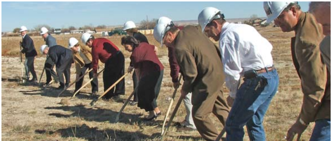
Library, education and government officials dig in the dirt at the groundbreaking ceremony in Pueblo West in November.

Construction on the 23,000 sq. ft. addition of the White Public Library is officially underway. The $6.6 million dollar project is expected to be complete in late 2008.