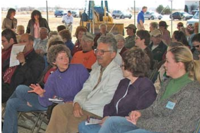
Library supporters gather for the groundbreaking ceremony in Pueblo West in November. The project features a 23,000 sq. ft. expansion.

The Pueblo City-County Library District thanks the more than 150 library supporters who gathered for the groundbreaking of the expansion project in Pueblo West and the countless other donors, volunteers and staff who have worked so hard to make this project a reality.