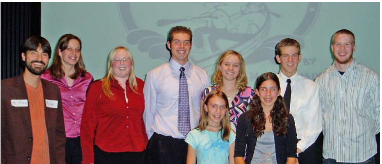
Library staff, Pueblo West High School students and two winners of the Big Fish Story contest pose for a picture at the Big Fish Storytelling Jubilee in the InfoZone in November. The Pueblo West students read each of the winning entries.

This celebration will include entertainment by school bands, choral groups, dancers, displays of creative writing, art work, poetry and much more. The satellite staff will give away free books, teen activities and provide story times. If 20 students attend from any one school, principals will be asked to kiss Wilbur, a live 300-pound pot-bellied pig! For more information, contact your local satellite library or Barbara Brown, Outreach Services, at 562-5631.