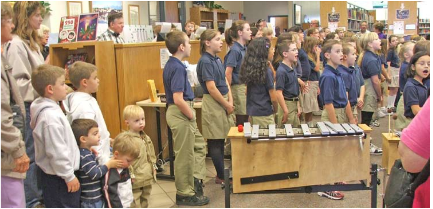
The Prairie Winds Elementary School Choir entertains the crowd gathered at the groundbreaking ceremony and 10 th anniversary of the White Library.