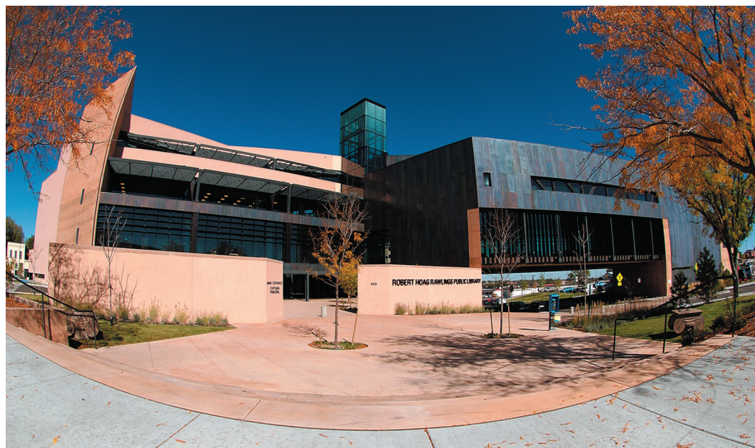
The Rawlings Public Library.