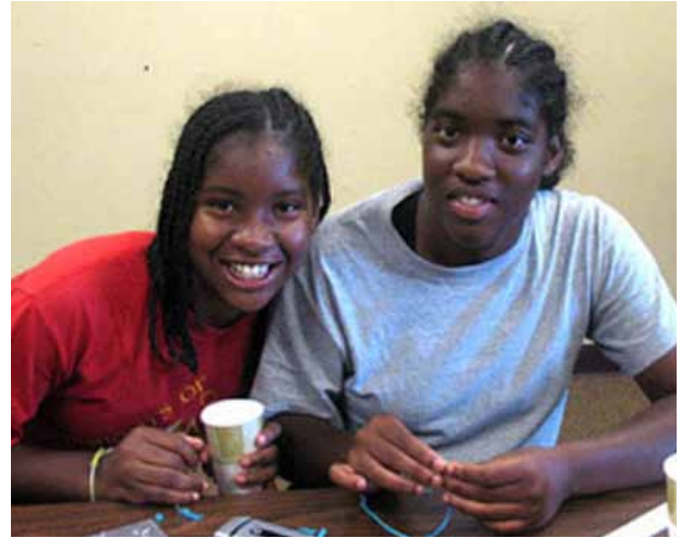
Teens show off some of the crafts they made at a recent Teen Summer Reading Club event at the Barkman Library.