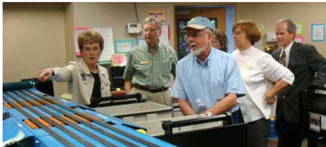
The Library Board getting a tour of the Lone Tree Library in Douglas County.