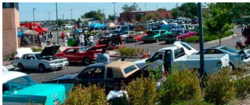
Cool cars filled the Rawlings Library parking lot during the 2008 Sweet Dreams Car Show.