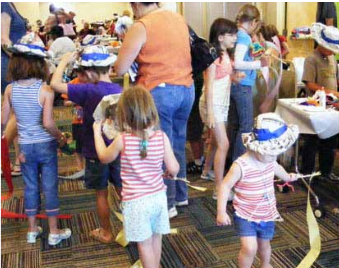
Kids enjoying craft day at the Pueblo West Library during a Summer Reading Club program.