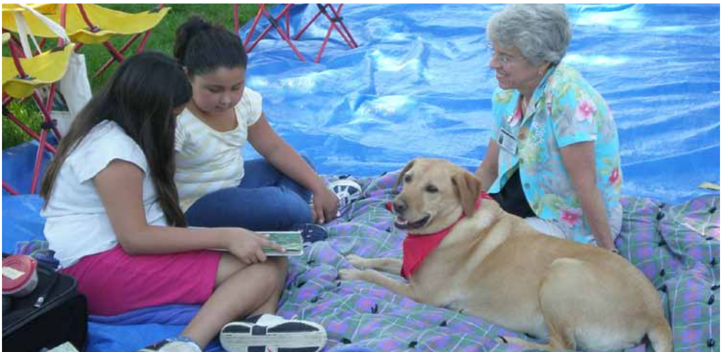
Children read to Chard'nay, a R.E.A.D. dog, at Bessemer Park during the Books in the Park program.

If you have questions, AskColorado's got answers. You can connect live with a librarian for homework help. The librarians are happy to locate resources to help answer your questions in an online chat format available 24 x 7.