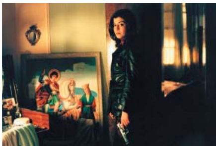
Scene from Viva Laldjerie .

A recent graduate of Princeton, Mia is now moving to Genovia to learn how to rule; her grandmother Queen Clarisse Renaldi will have to teach her poise, decorum and diplomacy before stepping down as queen of Genovia, so Mia can be crowned. When Mia arrives in Genovia, she discovers that by Parliament's rule she must marry before 30 days is up or forfeit her crown; she is stunned! Mia has always wanted to marry for love, and who can possibly expect someone to fall in love in just 30 days?