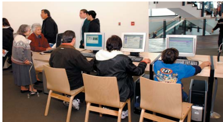
Patrons enjoy many free electronic services including free internet access and online database subscriptions at the Rawlings Library.