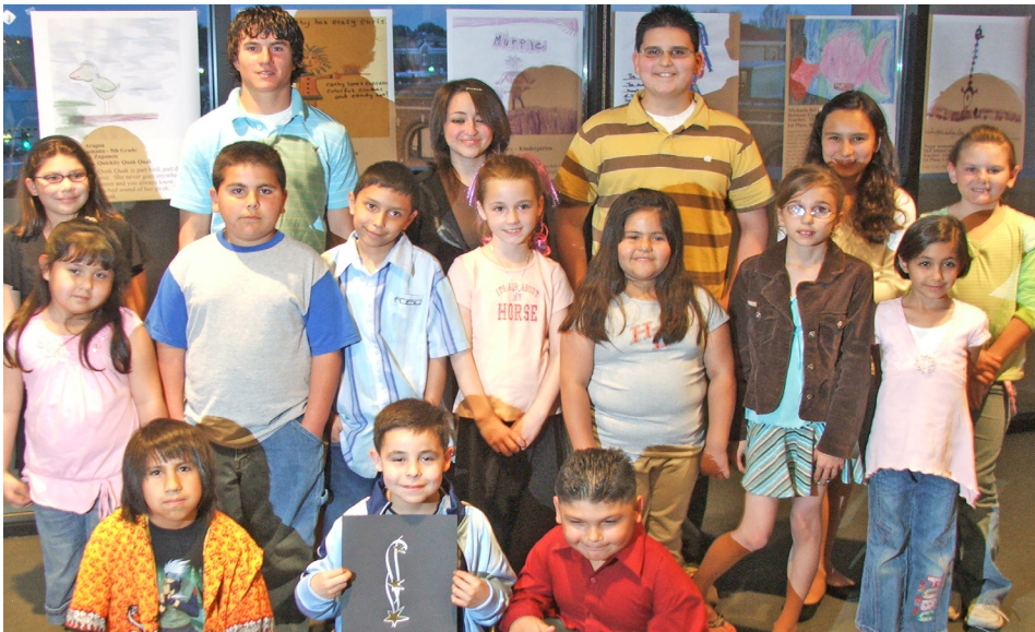
The 2007 winners of the Draw Your Own Dr. Seuss Character Contest at their awards ceremony.