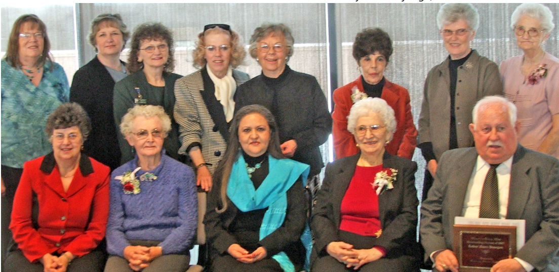
This year's award recipients, who were all honored by their community organizations in March.