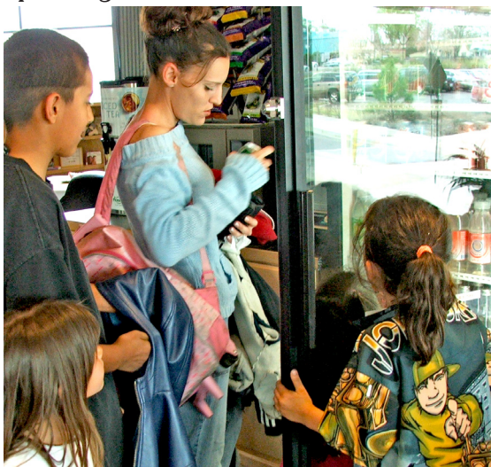
Customers pick out cold drinks at the Corner Café.