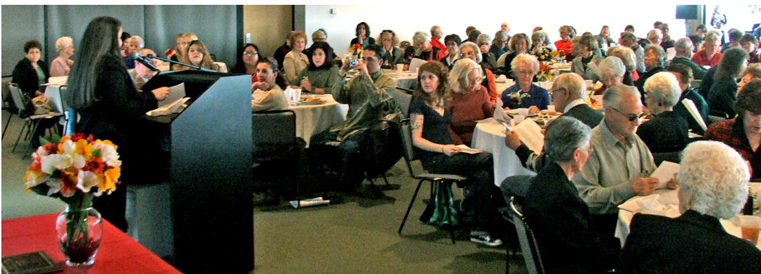
Nearly 150 people attend the Outstanding Women's Awards Luncheon at the Rawlings Library in March.