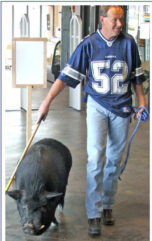
Wilbur the potbelly pig and his owner visit the library to pig out on books in March!