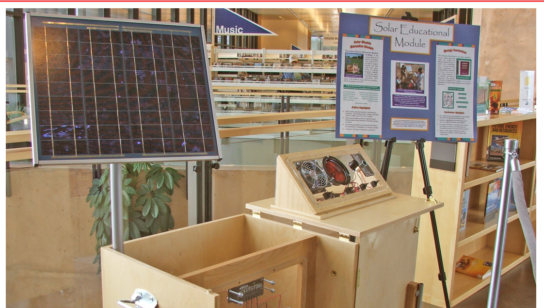
Solar education module on display at Rawlings Public Library courtesy of Smart Growth Advocates of Pueblo.