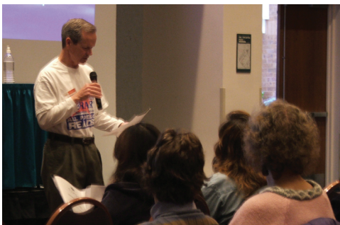
Staff Development Day - February 2006

On February 20, I was privileged to spend most of the day with the ladies and gentlemen who comprise the staff of this incredible edifice, and who work so diligently to make sure that the citizens of Pueblo are able to use this facility to its fullest extent. Was I impressed? I should hope to shout!