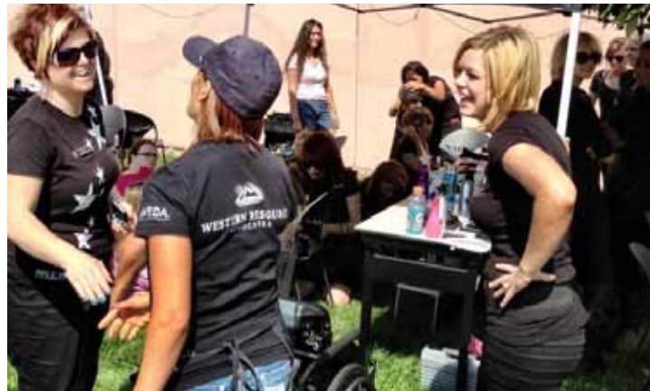
PCCLD teamed with Euphoria Salon in August for this back-to-school extravaganza! Nearly 500 kids got haircuts, signed up for a new library card, did a Crazy Hair Craft in the library and went on a library scavenger hunt.