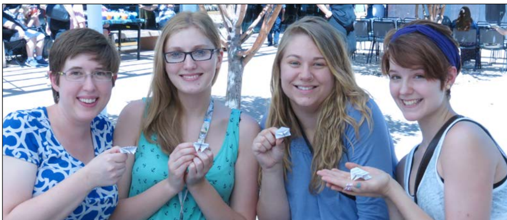
These girls had a lot of fun making origami animals at one of the Art Bash events held at Rawlings this summer.