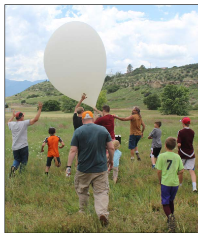
Operation weather balloon was a success! Launched from the Greenhorn Valley in Colorado City, mission control at Rawlings tracked the balloons flight path. It was later recovered northwest of Hooper, Colo., in the opposite direction of the speculated flight!