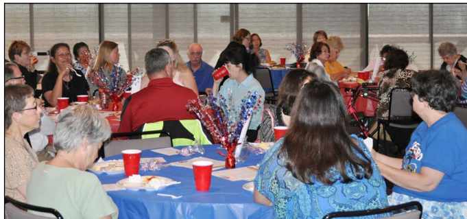
Volunteers from all departments and libraries in the district were treated to a luncheon in June to thank them for their service.

(Number current as of newsletter deadline. Last year the total number of participants was 500 by the end of August. For information on Adult Summer Reading, see page 10.)