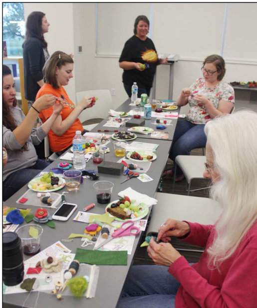
Greenhorn Valley and The Felted Dog in Colorado City enjoyed an evening of felting flowers, part of the Adult Summer Reading Program.