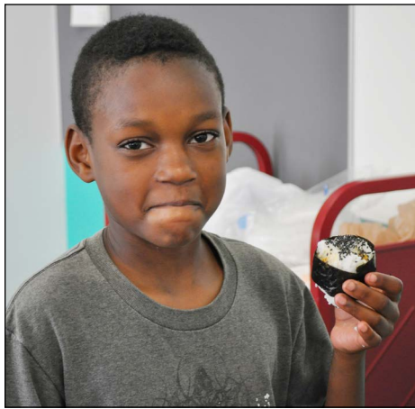
A young boy holds up his Japanese rice ball "Onigiri" creation after a program held at Lucero Library for Summer Reading. Those in attendance were given a hands-on lesson on how to make the delicate treat.