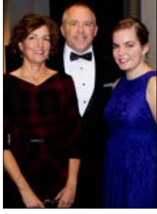
Above: The Moore family.