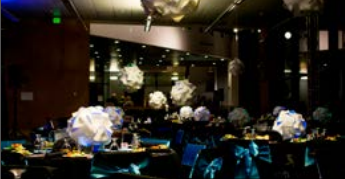
The 2^{nd} floor fiction section of the library was transformed into a futuristic dining area.