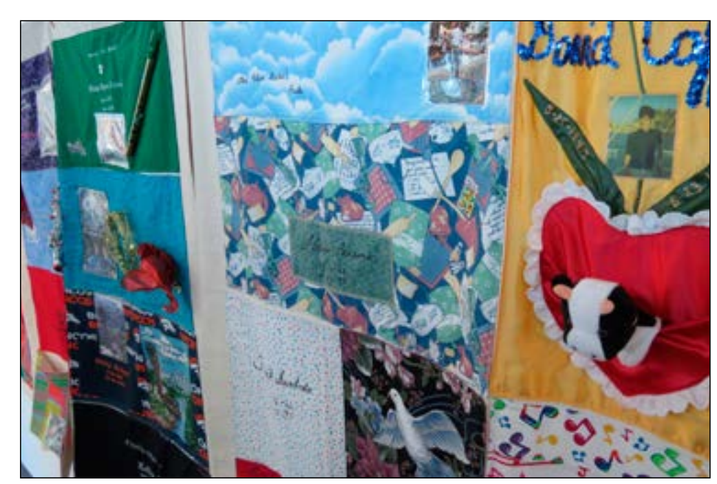
AIDS quilts on display on the 4^{th} floor of the InfoZone at Rawlings Library.

In honor of World AIDS Day on Dec. 1, the InfoZone and Pueblo Consumer Advisory Coalition will display quilts made in honor of those affected by AIDS. These beautiful quilts will be on display throughout the month.