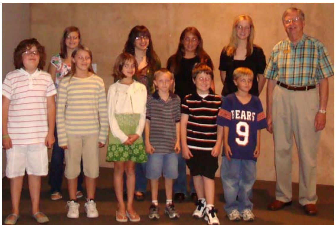
Winners of the Up With Reading Bookmark Contest pose for their picture at the awards ceremony in September.

All skill levels are welcome to join the Origami Odyssey Club of Pueblo for an evening of paper-folding fun. Instruction on folding origami toys and action models will be taught. All materials are provided free of charge. For more information, please call (719) 553-0207.