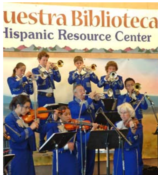
Mariachi group Arcolris at the library in September.