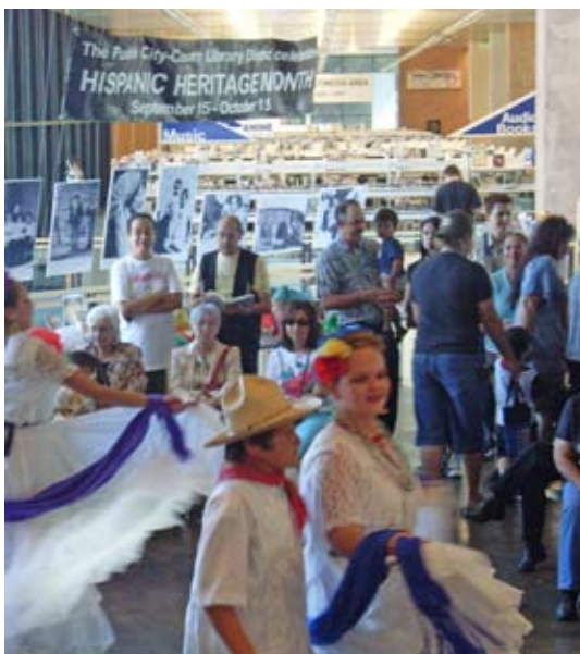
Grupo de Folklorico dancers perform in September.