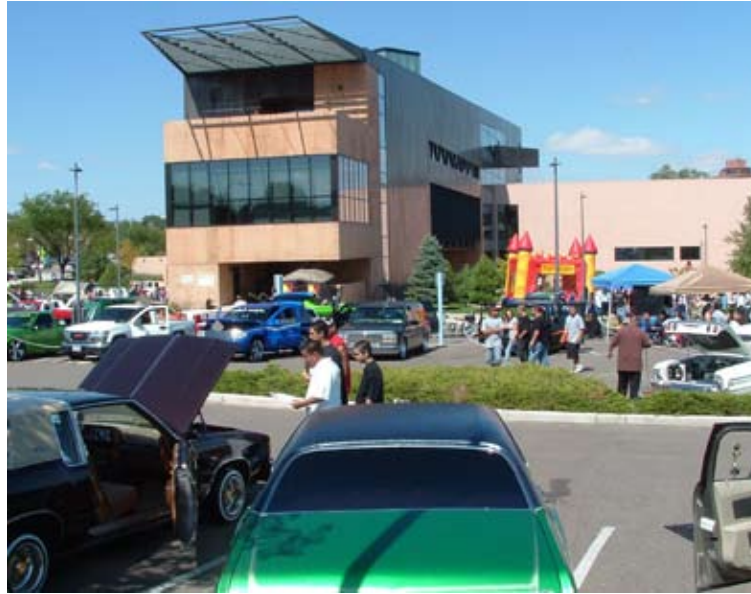
Car show fun and festivities in celebration of Nuestra Biblioteca anniversary.