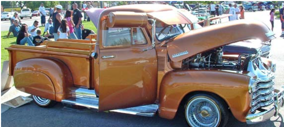
Winner of Director's Choice award at the Sweet Dreams Car Show held at the library for Nuestra Biblioteca event.