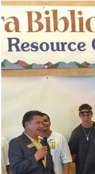
State Rep. Abel Tapia speaks.