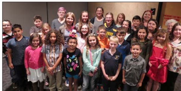
Winners of the Scary Story Contest. There were 1,760 entries.