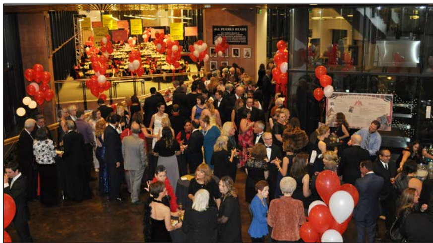
The 2 nd floor of Rawlings is transformed for the Booklover's Blacktie Ball featuring author Sara Gruen.