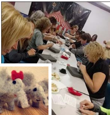
A herd of felted elephants were created at Lamb and Greenhorn Valley Libraries.