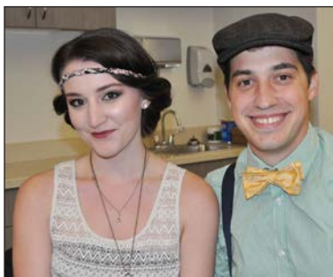
A couple dressed for the 1920s at Jazz & Gin, a prohibition taster at Greenhorn Valley Library.