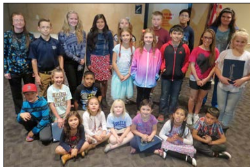
Winners of the Create Your Own Circus Character Contest. There were 792 entries.

Compete against friends and family in this hilarious bingo game that will test tastebuds with the finest and foulest jelly beans in the Harry Potter universe!