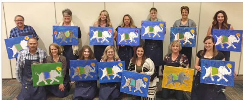
Painted elephants at Pueblo West Library.