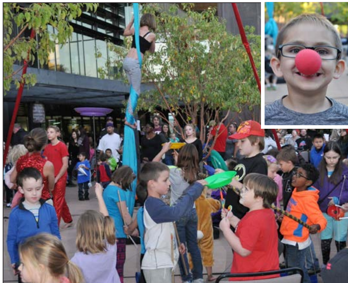
Salida Circus performers (top left and right) entertained guests at Rawlings Library during the Family Circus Festival and Fun Festival to kick off All Pueblo Reads.