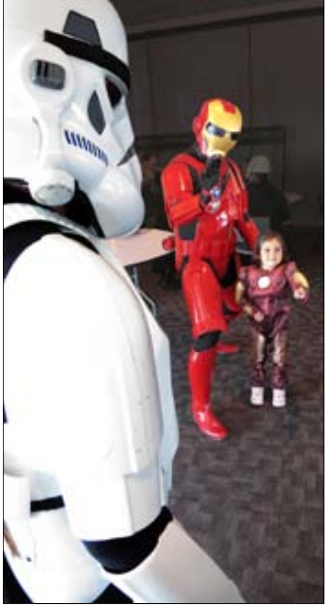
Stormtroopers are no match for Iron Man and his daughter. Is this the preview for Iron Man 4? No, it's Free Comic Book Day II held May 4 at the Rawlings Library. May the fourth be with you!

Please visit the PCCLD website in June to find these great new services at www.pueblolibrary. org. Call 562-5642 for more information.