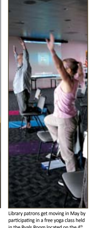
in the Ryals Room located on the 4th