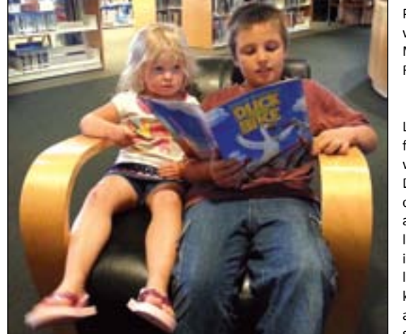
ABOVE: The 2013 Poetry Contest winners were honored during a May celebration at the Rawlings Library.

LEFT: This year's selection for One Book 4 Colorado was Duck on a Bike by David Shannon. A free copy of the book was available at all PCCLD libraries for 4-year-olds in efforts to promote literacy. What do you know? These children at the Rawlings Library seem to enjoy it!