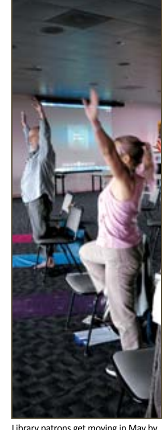
floor of the Rawlings Library