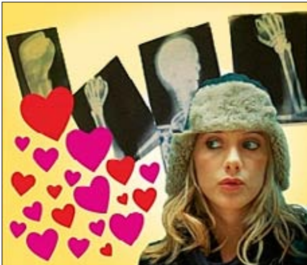
Mélanie Laurent stars in The Day I Saw Your Heart .

Learn about archaeology and artifacts through a hands-on demonstration. The audience will be introduced to examples of what can be found at a dig site and explore the possibilities of archaeology field work. (This is open to all ages, no registration required.)