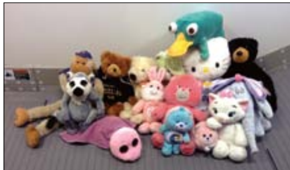
The library can be a strange and mysterious place. Like a gaggle of Fraggles, children brought their beloved stuffed animals to the Rawlings Library to spend the night. Who knows what hi-jinks they were up to while sleeping over? The tribe pictured here seemingly had a blast riding circulation's conveyor belt like a roller coaster until the break of dawn.