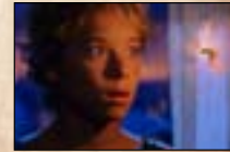
Peter Pan and Tinkerbell