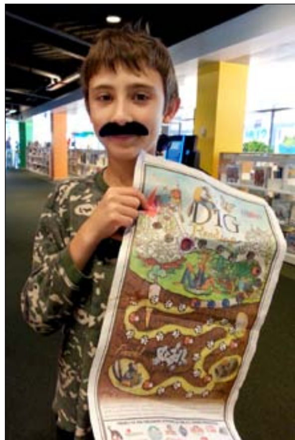
Summer Reading at Pueblo City-County Library District is a great way for kids to spend the summer. Pictured here is this summer's first Summer Reading Game Board prize winner. What prize did he win? The answer lies somewhere below his nose.

to lose the learning momentum from the prior school year and can forget significant pieces of what was learned. Scholarly research supports this notion, and, also, that this decline can be more pronounced with reading skills. Evidence shows that those who are better readers are those who read more, and when reading slows or stops during the summer, then skills atrophy. In order to help prevent this setback, the library district's summer program features events and activities designed to promote and encourage reading among our youth.