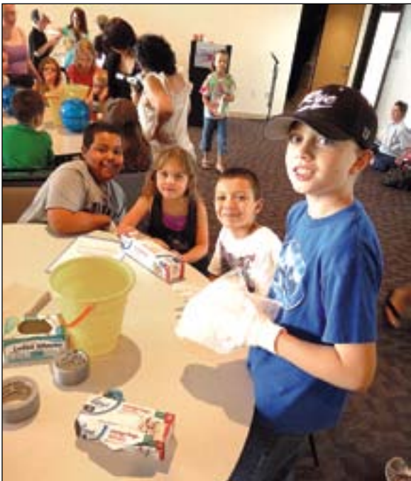
Dig into reading by biting into some homemade ice cream! Dessert making was a big hit in the hot Summer Reading month of June. Dozens of children participated in the Dig Into Ice cream program held in the Ryals Room at the Rawlings Library.