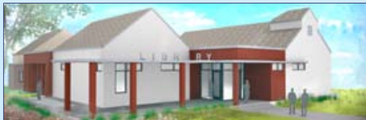
An illustration of the upcoming St. Charles Mesa Library.

The public is invited to participate in a series of meetings that will allow the library district to gather community input in the development of these exciting exhibits. Join us!