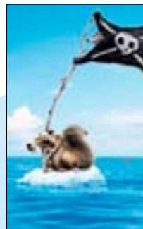
Ice Age: Continental Drift