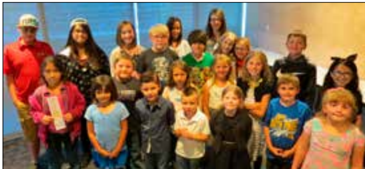
Winner's of PCCLD's Create your Own Bookmark contest. There were 2,415 entries.