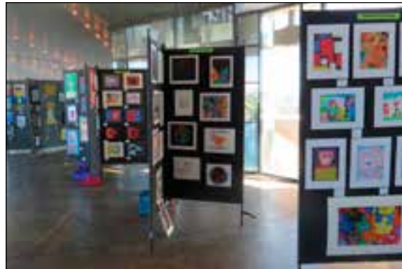
Pueblo City Schools held their annual Elementary Art Show at Rawlings Library in May.