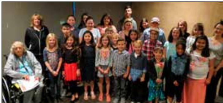
Winner's of PCCLD's 20th annual poetry contest. There were 1,335 entries.