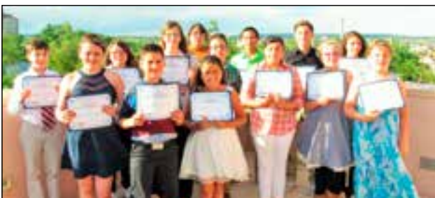
Winners of Pueblo City Schools 2017 Superintendent's Writing Awards pose for a photo on the balcony of the Ryals Room at Rawlings in May.