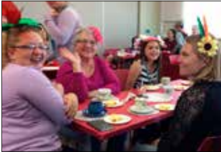
Ladies of all ages enjoy the Mother's Day Tea at Giodone.