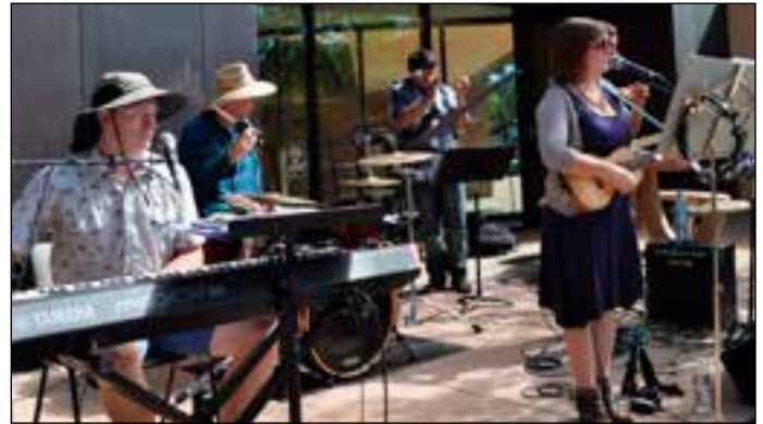
Members of Friberg Friday will perform as The Flock at the kickoff.

An interactive exhibit featuring hands-on and multimedia components encouraging new perspectives about engineers and their vital work. See page 12 for details.