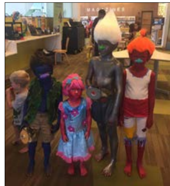
A family of trolls attended IDEA Con 2017 at Rawlings in June.