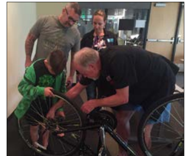
The Great Divide hosted a fix-a-flat bike clinic at Rawlings Library as part of Summer Reading in June.