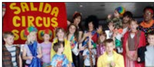
Salida Circus performers with past summer attendees.

For more information on Youth Services events, please call 562-5600.