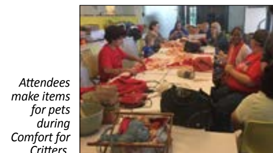
Attendees make items for pets during Comfort for Critters.