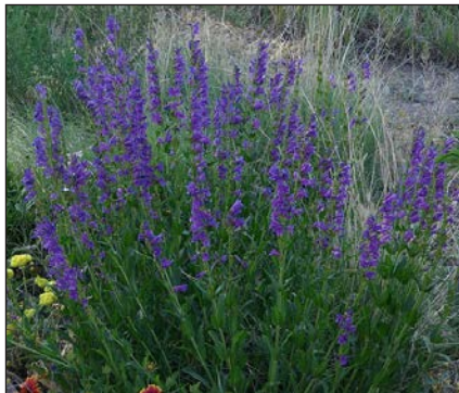
Rocky Mountain penstemon

Join Ed Roland, CSU Extension Native Plant Master to learn where to find seeds, how to germinate Western Native species and how to expand your garden with cuttings from a single parent plant. Participants will also learn how your garden can benefit from the All Pueblo Grows Seed Library, and how you can help build this resource.