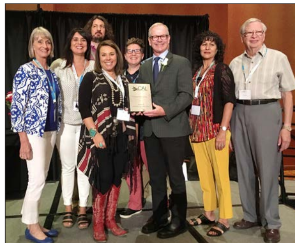
In September, PCCLD was named Colorado's 2018 Library of the Year by the Colorado Association of Libraries.

These awards, individually and collectively, are coveted by public libraries across the nation. All these designations together in a single year may be unprecedented and represent the highest honor for our community and each of those individuals who are