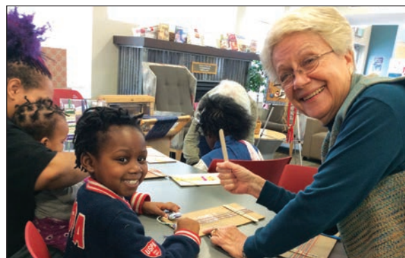
A young patron enjoys weaving a bookmark during a craft at Giodone.

Do you want to know the history of Valentines Day? You can find a book for that. Would you like a menu for a special dinner for the ones you love? Cookbooks are available in the library. Would you like to make Valentine cards? Check out the craft classes at your local library branch. Want to show some love to a child