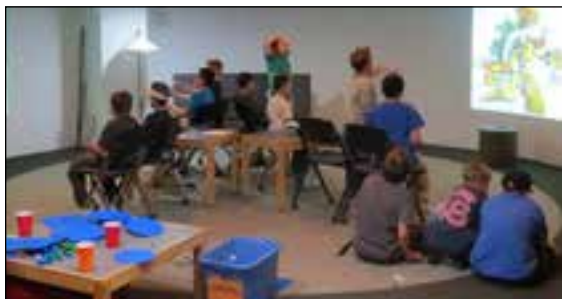
A Wii Smash Brothers video game tournament was one of the many activities offered to kids at Rawlings Library during Spring Break in March.