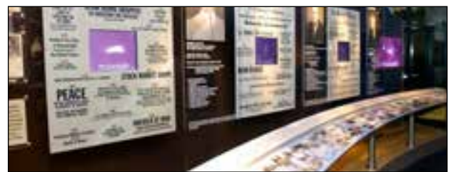
The InfoZone News Museum located on the 4 th floor of the Rawlings Library.