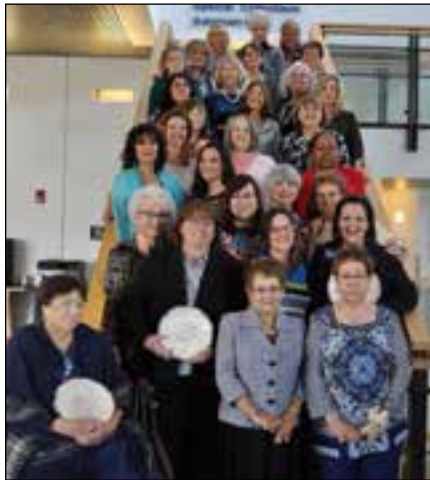
A total of 32 women were honored at the Outstanding Women luncheon held at Rawlings Library in March. Over 215 people attended the luncheon.