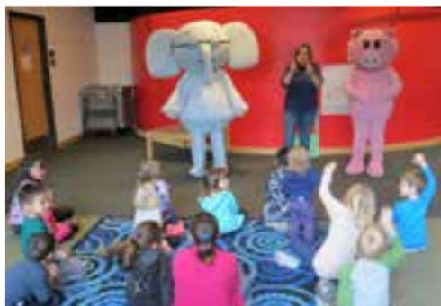
Elephant and Piggie visited the libraries over Spring Break. Here they are at Rawlings Library.