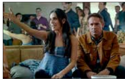
Busco Novio Para Mi Mujer

“El día de los niños/El día de los libros”, conocido también como “Día”, es una celebración de los niños, las familias y la lectura, que culmina cada año el 30 de abril. La celebración enfatiza en la importancia de promover el alfabetismo para los niños de todas las procedencias lingüísticas y culturales.