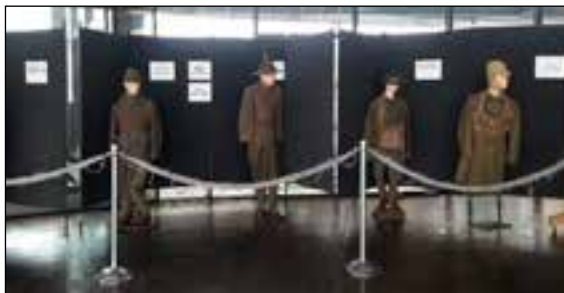
Mannequins dressed in WWI attire.