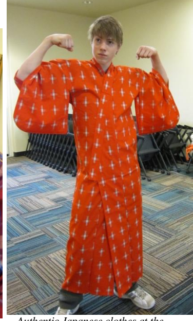
Authentic Japanese clothes at the Anime Fair