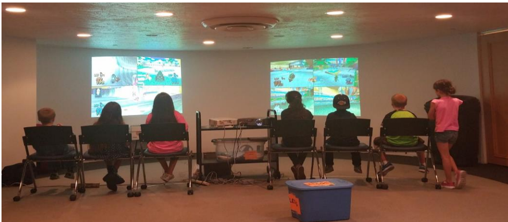
Tweens play Mario Kart at Thursday Hangouts.