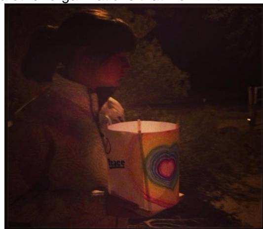
A girl with her peace float, ready to deploy into the Arkansas. This float was made at the library.