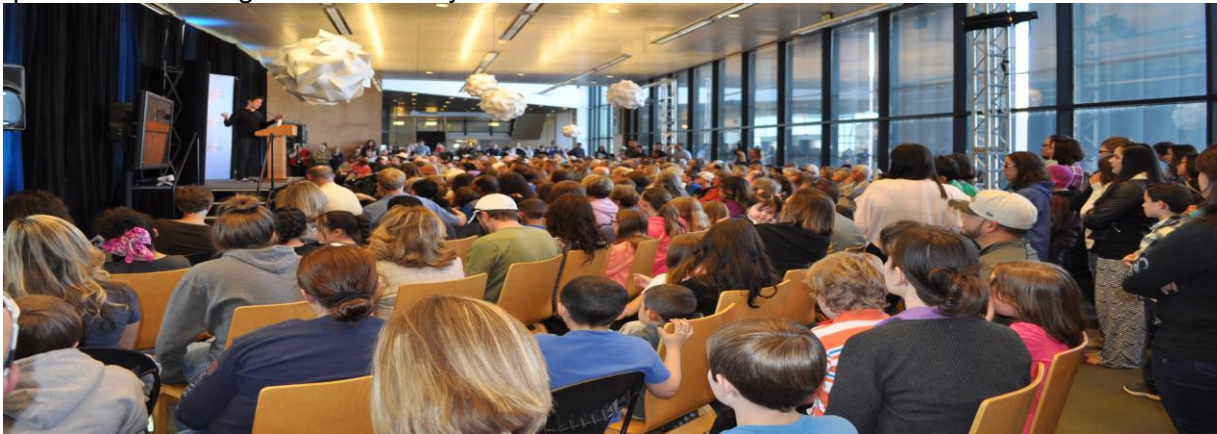
Tory Belleci's presents to a standing-room-only audience on November 7 at Rawlings Library

All Pueblo Reads concluded earlier in November with record participation for 2015. 39,513 people were involved in one or more of the many programs, events and activities this year. The theme was Celebrate Sci-Fi proved popular with its focus on four great reads: Ender's Game by Orson Scott Card, Divergent by Veronica Roth, The Giver by Lois Lowry and The Hunger Games by Suzanne Collins. The featured presentation this year was by guest speaker Tory Belleci, who is best known for his starring role in the popular television program MythBusters . Key partners and sponsors included the Friends of the Library, Black Hills Energy, Pueblo City Schools, Pueblo County School District and the Sangre de Cristo Arts and Conference Center. A more detailed report is forthcoming later in January.