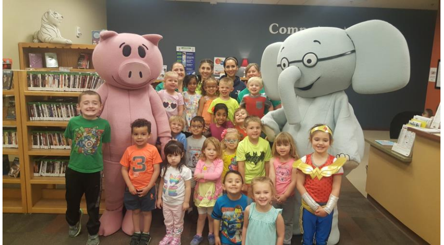
Elephant and Piggie at Library @ the Y