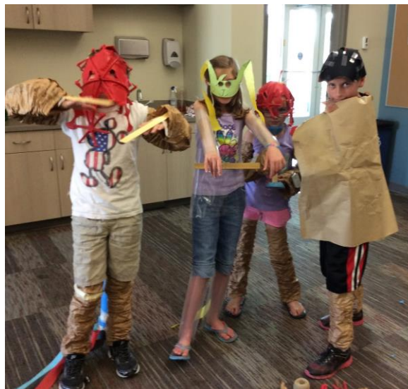
Participants in the Tween Construction Challenge show off their costumes.