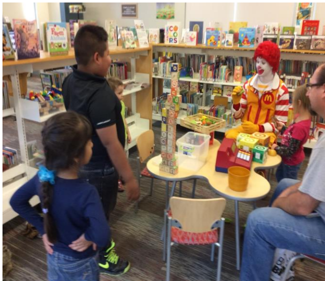
Ronald McDonald visits with kids at Giodone