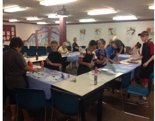
Tweens enjoy a centralized program called Extreme Art on Thursday June 30. Over 20