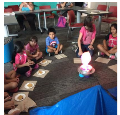
S'mores and more – Library Camp Out