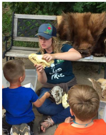
Skins & Skulls (presented by Mountain Park Environmental Center)