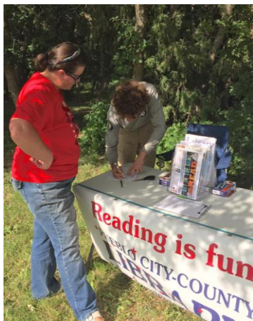
Thanks to our AmeriCorps volunteers!