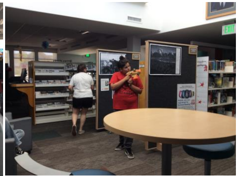
Laser Tag at Lucero