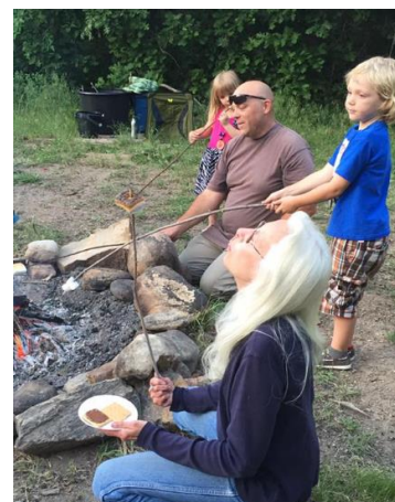
Campfire Stories & S'mores