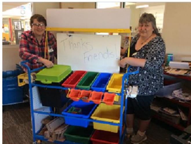
Maker Cart purchased with Friends of the Library grant.