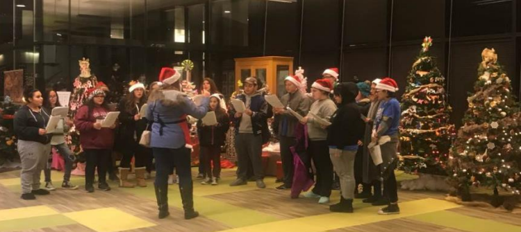
Central High School choir spreading holiday cheer!