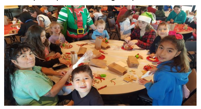
Customers of all ages enjoy making gingerbread houses

Pueblo West with 50. Teen kits included Candles and Shrinky Dinks at Pueblo West with 22 participants, Video Games at Pueblo West with 12; and a Button Making Bonanza at Lamb with three.