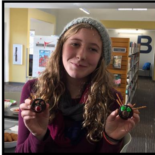
Cookies & Cocoa