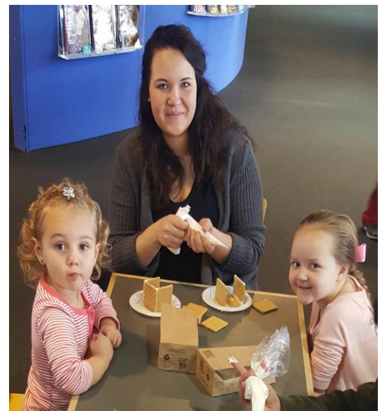
Families created gingerbread houses together