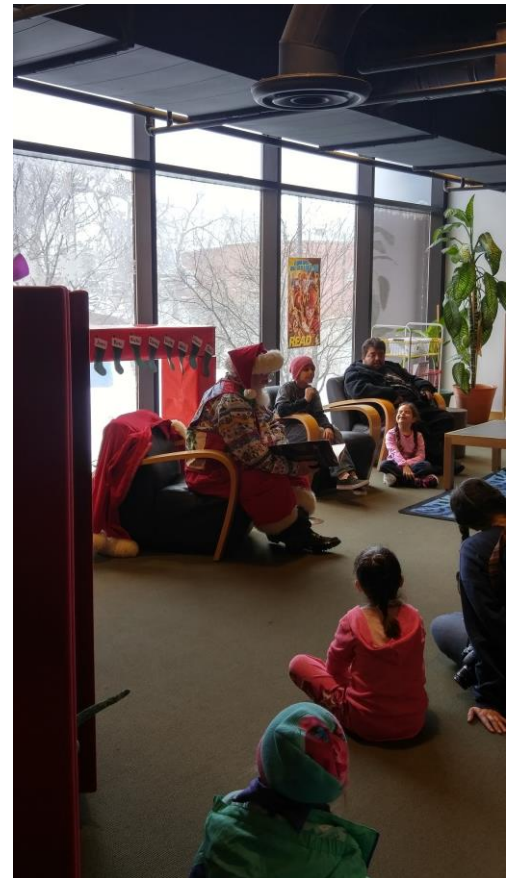
Santa reads to the kids at the Rawlings Cookies and Cocoa program.