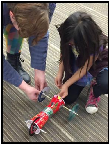
Growing Steam Makers