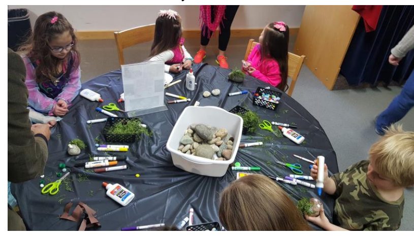
Kids make rock trolls at Frozen Festival on December 30.