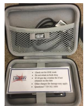
Hotspots at Greenhorn Valley are Hot!