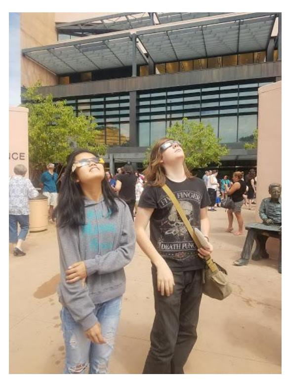
Teens from the Teen Advisory Board watching the eclipse.

with 188; two Carlile Summer School visits with 36; Storytime at Imagination Station with 25; Heritage Elementary Family Night with 80; Library Table at PRIDE with 80; Carlile Family Night with 78; and Pueblo Academy of Arts Family Night with 100.