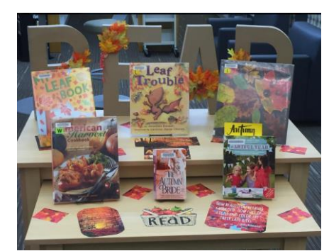
Kicking off the Fall season with great displays.