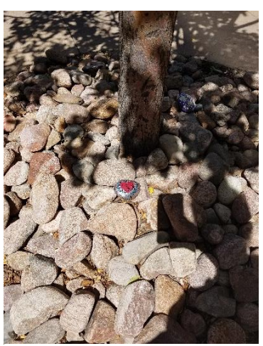
Hidden Rocks with Blue Sky