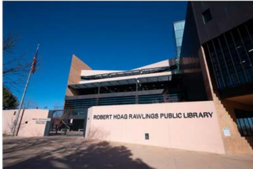
Robert Hoag Rawlings Public Library at 100 E Abriendo Ave.

Pueblo youths have a chance to earn $100 through a Pueblo City-County Library District summer reading program.