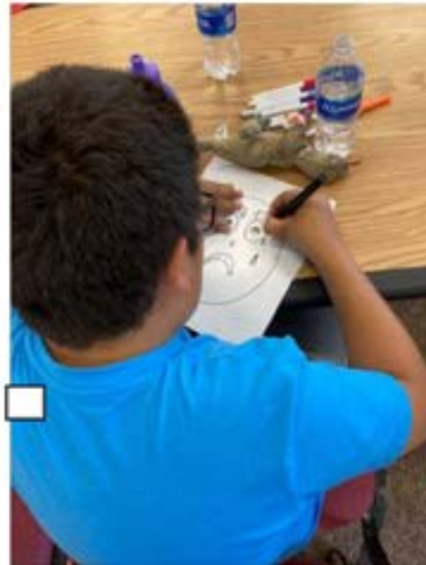
A boy draws a picture at "Good Grief!" kids camp. The first camp this summer will be held on June 10 in Canon City.

Summer Reading Carnival Kickoff, Grome Park, 159 Jewell Ave. | Get your summer off to a great, productive start with a carnival in the park. Starts at 5:30 p.m. with an aerial acrobatics performance by Salida Circus. They'll perform again at 7 p.m. There will also be goats and piglets at the FARMily petting zoo, and carnival games with prizes. Vendors and food trucks will also be present at this free event, which is open to the public. Overflow parking is available at Rawlings Library. Sponsored by Pueblo Parks and Recreation and Pueblo City-County Library District. For more information, visit www.pueblolibrary.org .