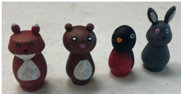
Wooden Figurines at the YMCA Craft Corner!

During the month of April, the YMCA preschool enjoyed themed stories, crafts and songs, including National Arbor Day and National Farm Animals Day.