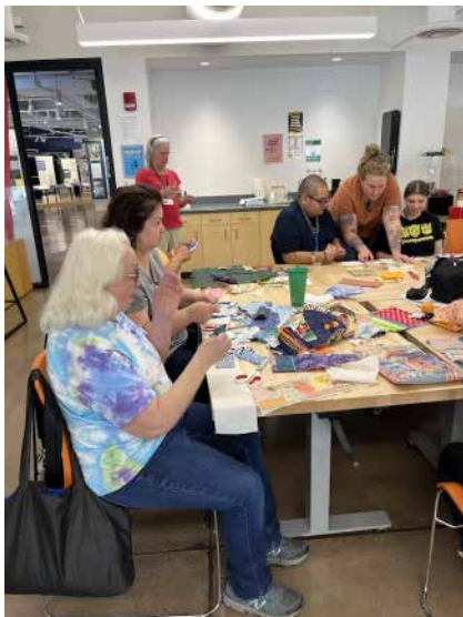
Memory Pouch in Slow Stitch (Rawlings Makerspace, Apr 21): 22 adult participants hand-stitched textile pieces; strong engagement with hands-on, creative learning.