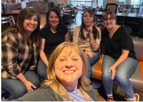
Photo: The Youth Services Team together at Copper River.

The Youth Services Team won the Team Spotlight Award! To celebrate, the team headed to Copper River, where they enjoyed dinner, bowling, and an escape room.