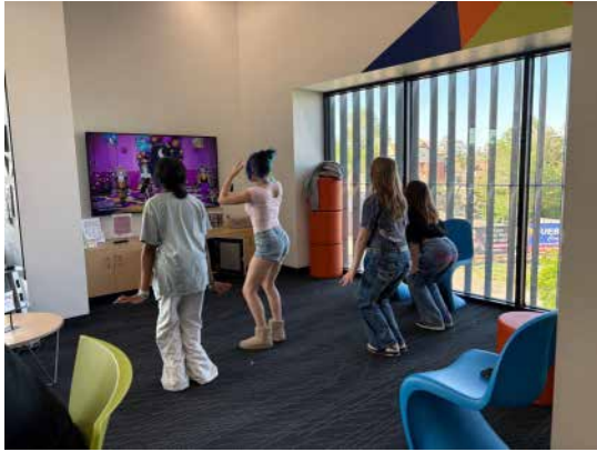
Photo: Four teens dancing along with the game in the teen area at Rawlings library.

Teens love dancing with the Just Dance video game, a new addition at Rawlings! This is a weekly favorite at the Teen Hangouts now.