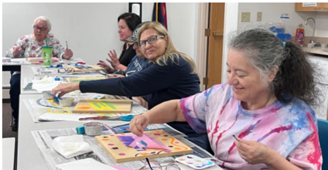
Painted Garden Signs in Senior Craft!