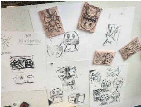
Prints and rubber mats made during the linocut program.