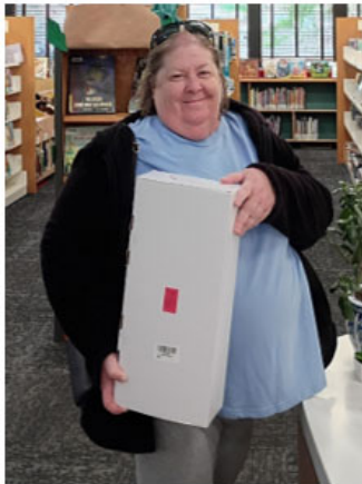
Seed Library Drawing Winner!

During March and April, Lamb Branch promoted its seed library for the spring season with a garden tool set drawing. The campaign was highly successful, resulting in 1,133 seed packets checked out over the two-month period. The drawing winner, Barbara O., was randomly selected from more than 200 entries!