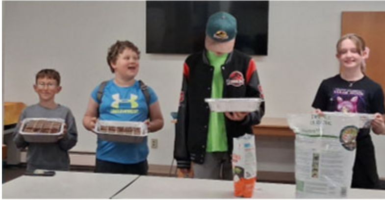
Teens and Tweens Celebrate Earth Day with “Seeds of Change”