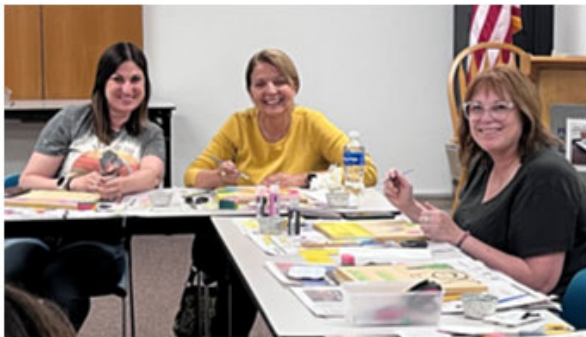
Two Surprise Guests at Adult Craft Night!

April programming embraced the themes of spring and Earth Day with a strong focus on creativity, nature, and outdoor learning. Participants made pocket-sized flower presses, stenciled reusable tote bags, crafted foraging bags, and painted garden signs. These projects were designed to celebrate and support time spent outdoors. In our Pocket-Sized Masterpiece program, attendees learned about Georges-Pierre Seurat and his iconic work A Sunday Afternoon on the Island of La Grande Jatte before creating their own mini cross-stitched version. We also welcomed a guest visit from the Pueblo County Parks and Recreation Department, who introduced participants to the basics of pickleball and encouraged active, healthy recreation