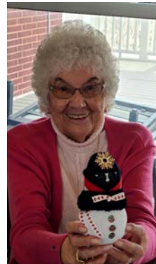
Pueblo Villa Snowmen Creations