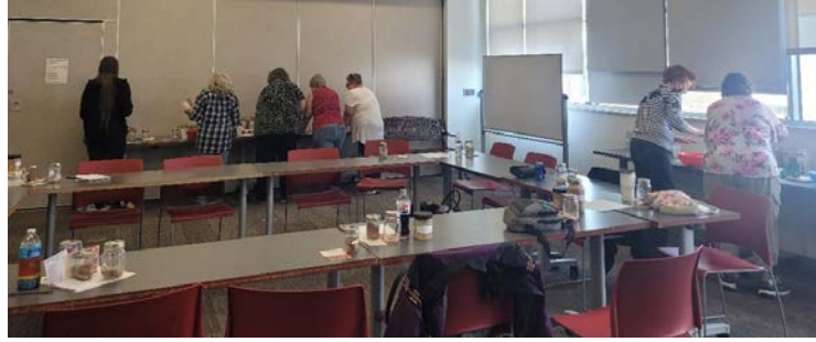
Spice Blend Class