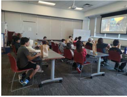
Spring Break Lock In