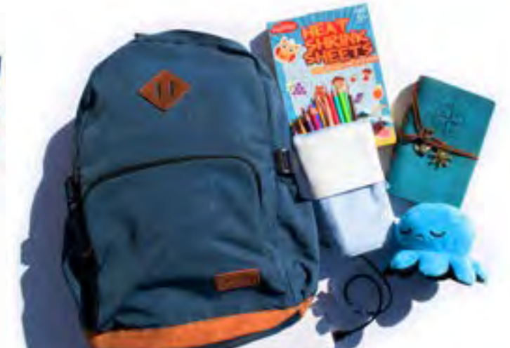
Grand Prize Pack for Ages 9-18