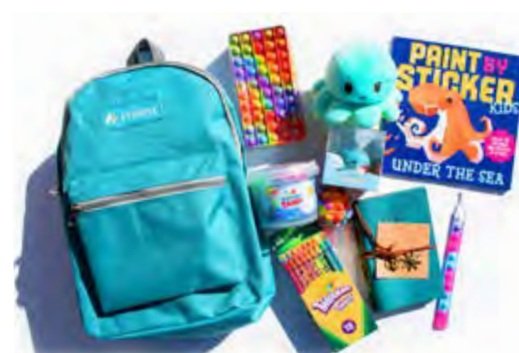
Grand Prize Pack for Ages 0-8

WEEK 8: Buell Children's Museum coupon at the Sangre de Cristo Arts and Conference Center